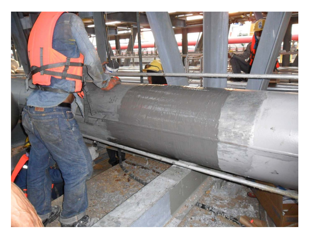
Apply DuraWrap primer for on prepared area.